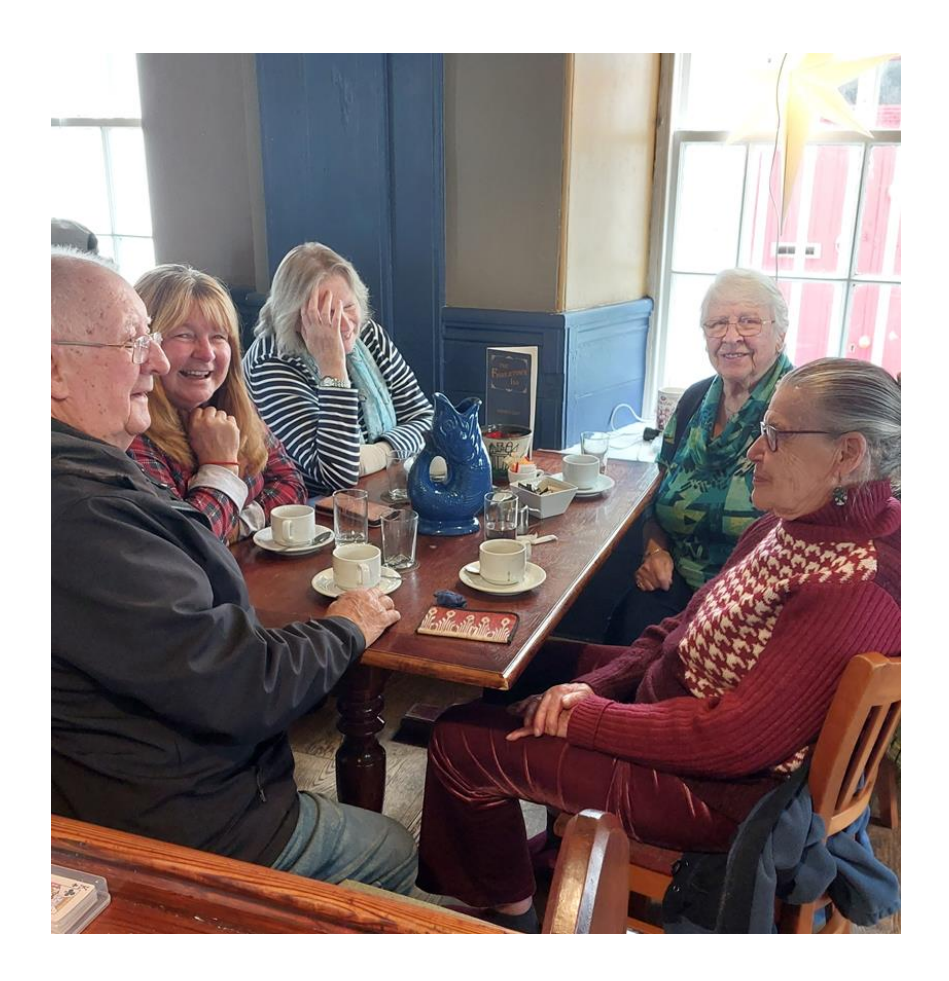
Lunch Club meets at 12.00 p.m. Charge: £3

Please note that, although costs have risen, the reduced charge to members remains the same as last year, thanks to new funding received from the Bank of Scotland Foundation.